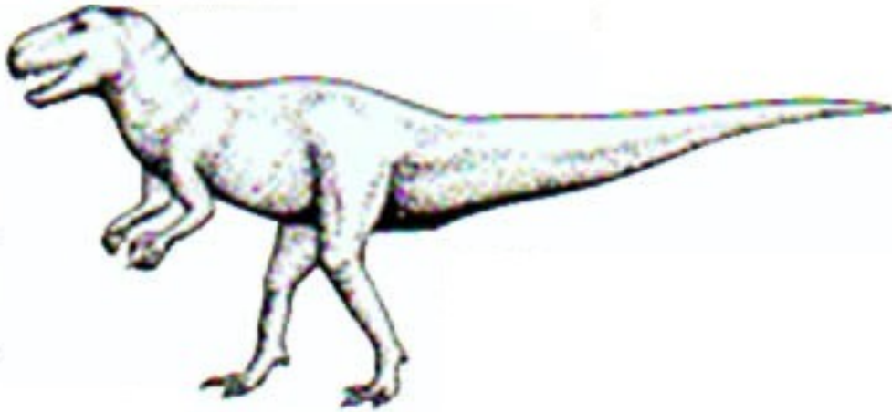
Figure 4.1: Allosaur for exercise 4.27

4.27. [3-F02:7] For an allosaur with 10,000 calories stored at the start of a day: